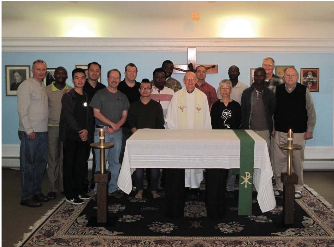
Participants at the 2018 Chicago Retreat