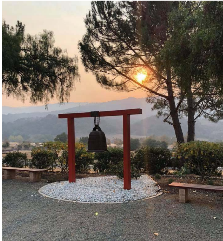
The Mission Bell at the Maryknoll Residence in Los Altos CA