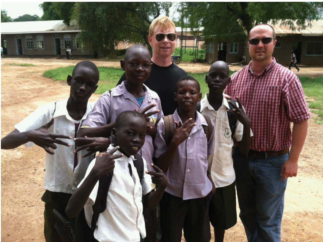
On safari in East Africa

vocation@maryknoll.org and we can arrange for you to spend a few weeks actually living with us at one of our missions in Africa, Asia or Latin America to experience what daily mission life is all about. It’s a way of exploring your future “slowly, slowly” and “step by step”.