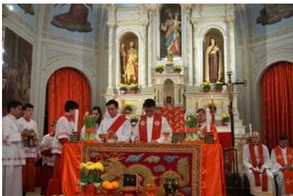
Chinese New Years Mass Chicago