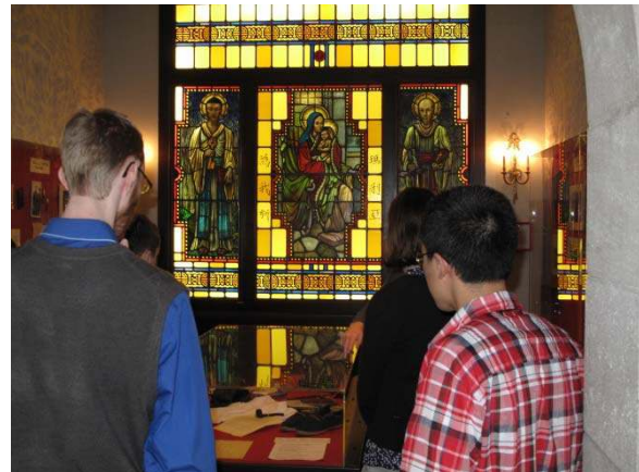
Visiting the Shrine of the Marknoll Founders during the Holy Week Vocation Retreat, Maryknoll, NY